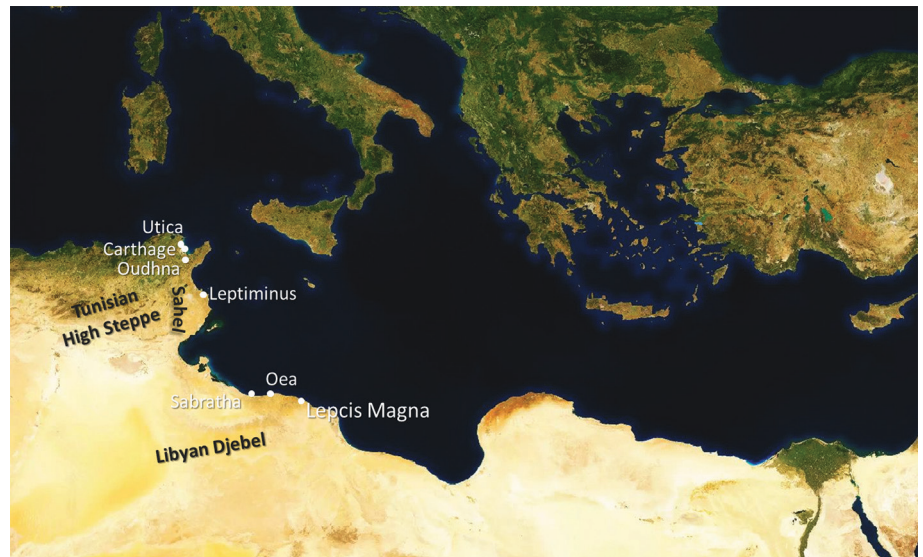
Figure 1. Coastal Tunisia and Libya with major sites and regions mentioned in the text (author).

of enormous olive groves and the construction of hundreds of multi-presses sites in the Tunisian High Steppe and Libyan Djebel, semi-arid regions that only receive 200–300 mm of rainfall per annum (Mattingly, 1988a, pp. 44–45; 1996, pp. 236–237; Hobson, 2015a, p. 99). The successful planting and cultivation of these olive trees resulted in the output of millions of litres of oil. The territory around the three cities of Lepcis Magna, Sabratha and Oea in modern Libya, for example, may have been producing up to 30 million litres of oil per year (Mattingly, 1988a, p. 37). If olive oil was being produced on an industrial scale, so too was pomace (Mattingly, 1988a; 1988b; Hitchner, 2002).