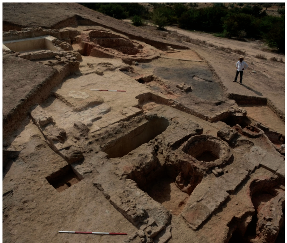
Figure 2. Area IV. The large lime kiln is visible at the top of the photo while smaller circular kiln 4022 is visible on the right-hand side. A rectangular cistern with rounded edges is located near the smaller kiln. Note the dark ash scatter near the lime kiln (photo courtesy of Andrew Wilson).

The site of Utica is located on the western side of the Mejerda estuary in northern Tunisia, 10 km from the coast (Hay et al. , 2010, p. 325). Originally a Punic settlement, the earliest structures date to the 8 th century BC. After the Roman defeat of Carthage in 146 BC, Utica was made the capital of the newly founded province of Africa. Although the city lost its capital status to Carthage after the Roman civil wars of the 1 st century BC, it nevertheless continued to prosper as an important port centre and many public buildings associated with large Roman cities, such as baths, basilicas and theatres