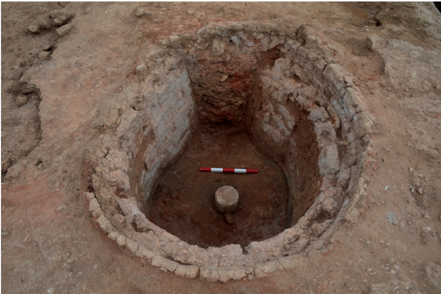
Figure 4. Kiln 4022, which went out of use in the 2 nd century AD.

In North Africa, the huge increase in olive oil production during the Roman period altered both the regional landscape