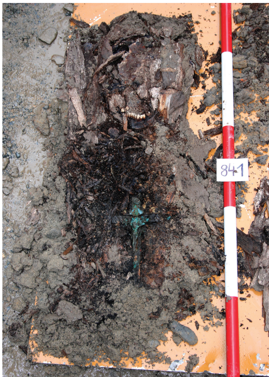
Figure 1. Skeleton number 841: field excavation.

identify the skeleton with a known person, and subsequently to look deeper into her life by means of the available written sources. Thus the skeletal remains from grave number 841 play a major role in this paper. The primary goal is to refer to the rare and unusual archaeological find of a postmortem invasion into the skull. The identification of the skeletal remains with a real historical person who has provided recorded information on the said postmortem manipulation is regarded as proof as to the correctness of our observations.