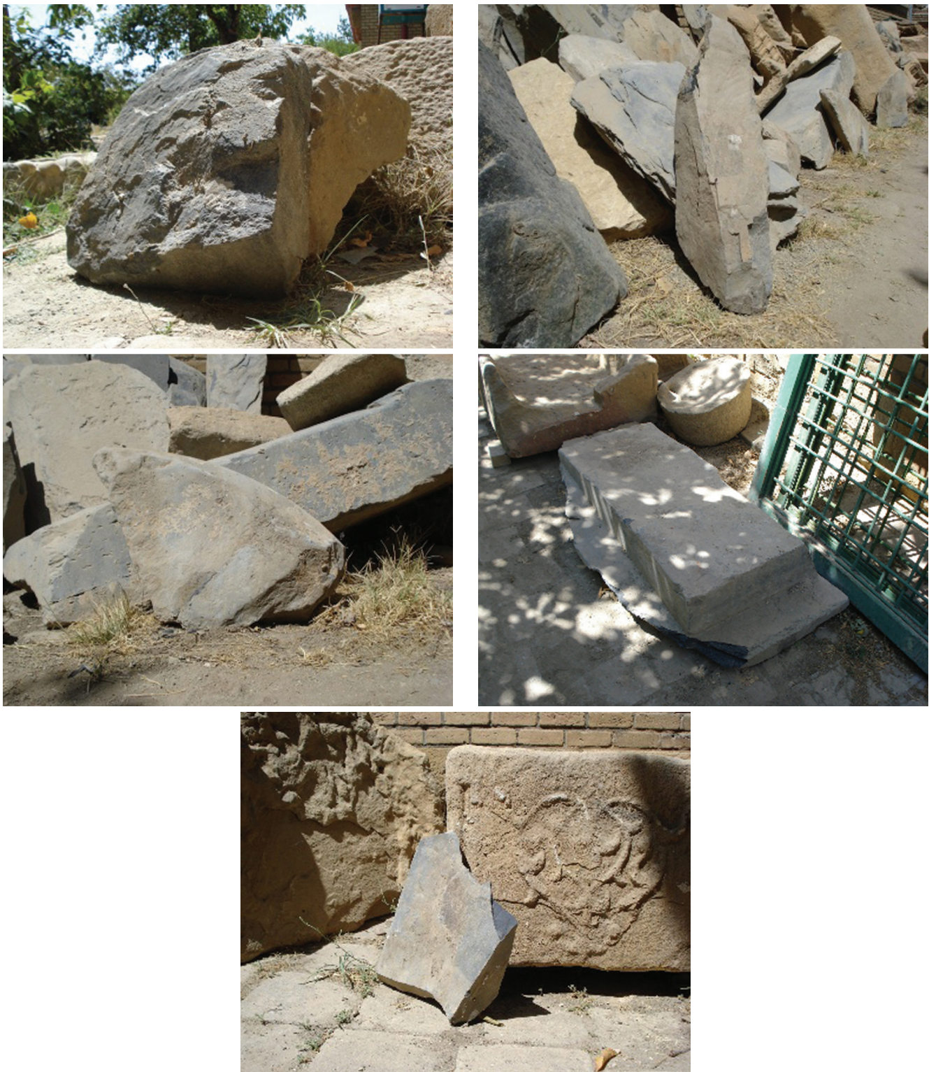
Figure 3. Samples number 5, 6 and 7, up, 2 and 3, from the Achaemenid column bases used for analysis by XRD.