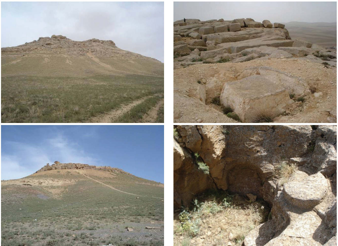
Figure 2. The methods of draw out from Khorzaneh, up, and Farhad Dash quarry, down.

Cyrus' palace and the audience hall, the residential palace, as well as his tomb, placed on a six-stepped platform (Brosius 2006, 9). The other royal Achaemenid palaces were located in Apadana, Susa, Ecbatana and Persepolis reference. The column bases of Artaxerxes II in the Iran National Museum, four pieces of engraved columns in British and Japanese museums, and a column in the Hegmatāneh (Ecbatana) museum (Saraf et al. 2007, 51–66) are remains of this period. Since most of the columns discovered in hegmataneh and its surroundings are stratigraphically considered to belong to the Parthian Period (256 BC to 224 AD). consequently, scientific determination of the origin of the stone quarries was considered to be necessary.