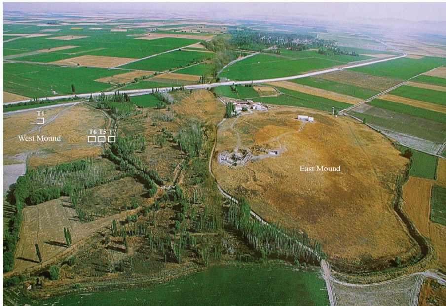
Figure 2. Aerial Photo of the Çatalhöyük East and West Mounds with the excavation trenches (Trench 8 is not on the photo; see Figure 1).