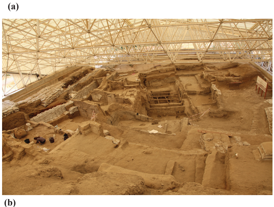
Figure 3. Structural comparison between the architectural layout of (a) building 98 of the West Mound (Trench 5) and (b) buildings of the Çatalhöyük East Mound.

alongside a more functional division of household space, an increase in the quantity and complexity of portable artifacts (especially pottery) and the development of a more integrated settlement system on the Konya Plain.