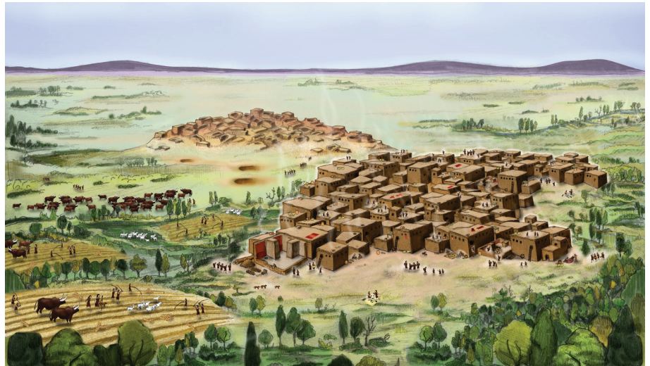
Figure 5. Illustration of the aftermaths of change around 6000 cal BC at Çatalhöyük (Illustration Mesa Schumacher, copyright Peter F. Biehl).

social change accompanied by climate and environmental change which eventually lead to the abandonment of the East Mound at around 6000 cal BC and after another ca. 500 years of gradual change in all spheres including the environment not only the abandonment of the West Mound but also the whole Konya plain.