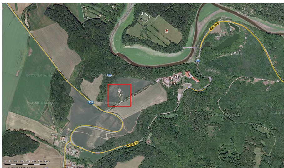
Figure 1. Overview of the research area.