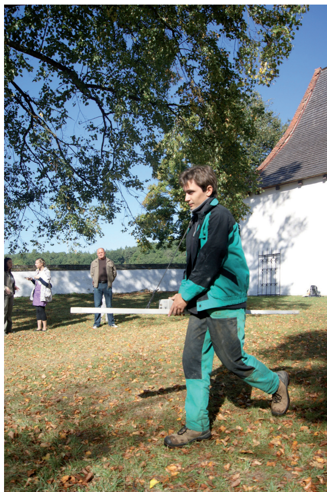
Figure 4. DEMP measurement in front of the chapel.

located about 400 m southwest of the Veverčí Castle, along the road leading from the main access road to the castle's upper gate. The chapel, also known as “Matky Boží Veverské”, dates to the 12 th century, and is first mentioned in written