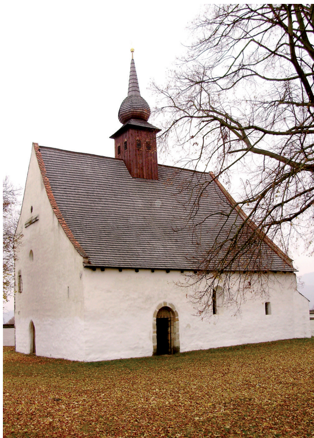
Figure 5. View of the snow-white Matky Boží Chapel.

records in 1240. In the vicinity of the chapel there was a medieval village which disappeared during the later Hussite wars (Flodrová 2002).